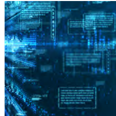
AI algorithms process the data