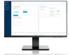
Receive quotes/orders virtually instantly