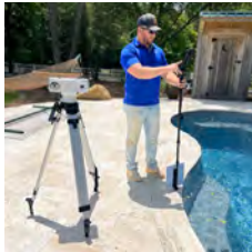
Pool measurements are captured