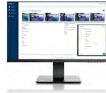
Go to the Builder Portal to quote/order