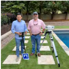
The tech team arrives poolside

We worked directly with our customers in the field to thoroughly test using Measure in a production environment.